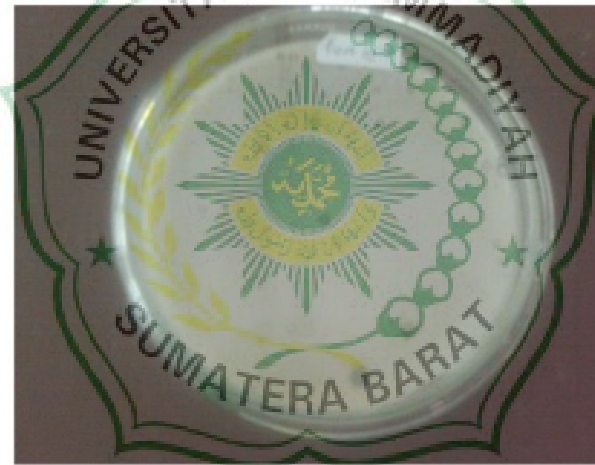
Figure 2. Result of lactid acid bacteria isolation from coconut oil and from palm oil with no evidence of growth.