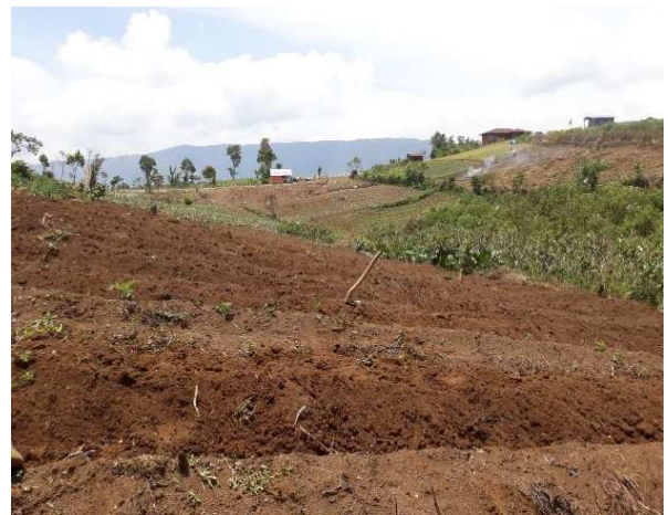
Figure 2. Photos of potato fields in the research location.

This research was conducted by means of a field survey in the potato production center area in the Upper Lembang sub-watershed. Samples were taken based on five groups of land units (Table 1). Based on the soil map, the potato production center area is dominated by two soil orders, namely Andisol and Inceptisol (Table 1). The study was conducted on V groups of farmers based on the physiography of the land, the groups are; groups I, II, III, IV and V. Group I is flat, II is slightly sloping, III is sloping, IV is flat, V is sloping. Therefore, it is the center of potato production. Soil samples taken are undisturbed soil samples with a ring sample for analysis of soil physical properties. For analysis of soil chemical properties, disturbed soil samples were taken using a Belgian soil drill.