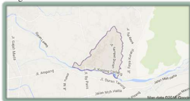
Figure 1. Research location and geographical area boundary in Korong Gadang Village, Kuranji Subdistrict, Padang City

on the North, and Kuranji River Batang in the South, as in Figure 1.