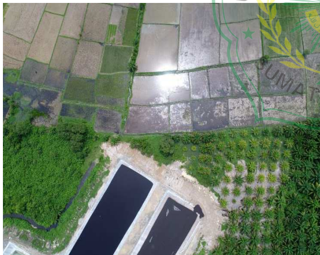
Fig. 1 Paddy soil contaminated by palm oil mill wastewater in Mangopoh Village, Agam District

The research was conducted in the soil field in Mangopoh Village, Agam District, West Sumatra, Indonesia at June-August 2018 as in Figure 1. Materials and equipment used include mineral soil drill (auger Belgium), Munsell book, GPS, sampling ring, and plastic samples. Figure 1 below shows the paddy soil which is contaminated by palm oil wastewater.