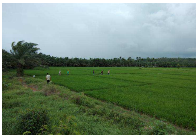
Fig. 5 Rice growth affected by wastewater spill palm in Manggopoh Village after 2 months.

The results of the analysis did not indicate any significant differences and influence on the control and the contaminated locations were due to land saturation and water circulation. This was as a result of irrigation and rain. Figure 3 shows the highest value was recorded at location 1 (control), while the lowest mean was at location 3, which was within the 200 m range of the waste pond. The graph of means grouping using Fisher's test shows palm wastewater did not significantly affect soil properties. Figure 4. show group of average value from Fisher's test; the value of the nature of the high ground is more likely to be in the positive zone. Meaning the change in soil properties is not too full due to palm waste. Besides, several studies have reported its capacity to be used as organic fertilizer, and Figure 5 shows the effect on the growth of rice for 2 months.