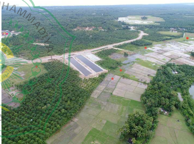
Fig.2 Location of rice field sampling contaminated by palm oil mill wastewater

The first sample was from the undamaged field upstream, while the second was from the contaminated rice field area, through land leveling from the closest point to the spill source, down to the furthest, in the direction of irrigation flow. The analysis of physical properties was performed on the uncontaminated unit, while chemical and biological evaluation was conducted on the supposed polluted filed.