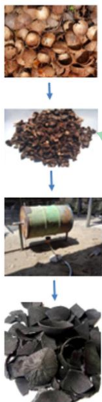
Figure 1. Biochar Manufacturing Process

VCO manufacturing waste, namely coconut shells grouped also in agricultural waste, when processed pyrolysis produces Biochar [8]. Biochar resulting from the imperfect burning of coconut shells can increase the quality of agricultural land, through absorption by Carbon, which causes an increase in the availability of P, N and K in the soil [7], [9], so as to increase crop production [8], [10]–[12]. The elements N, P and K are indispensable in the biochemical reactions of plants for their survival and production.. Likewise, Biochar has a sufficient concentration of micro and macro elements such as sodium, copper, potassium, calcium, zinc, magnesium, iron, etc. [6] that can support the survival and production of plants.