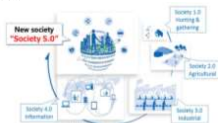
Figure 1. Development of Society 1-5 ( https://www8.cao.go.jp/cstp/english/society5_0/index.html )

Drastic changes from one era to the next require a human resources development model that is in line with the needs of the times and changes between eras as shown in Figure 1 below.