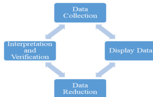
Figure 1. Interactive Data Analysis Technique (Miles & Huberman, 1994)

The data were analyzed interactively based on the concept developed by Miles and Huberman as shown in Figure 1.