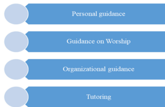
Figure 4. Forms of Self Control Counseling during a Covid-19 at SMP 1 Muhammadiyah

Personal counseling at SMP 1 Muhammadiyah Kuansing Singingi is given to students to understand their inner state so that they can solve problems and struggles within themselves. The Covid-19 condition requires counseling in this form, so as to minimize confusion in thinking. The function of personal counseling carried out at SMP 1 Muhammadiyah Kuantan Singingi is the same as a statement by Ng'eno and Magut that personal counseling to students can clarify the direction of their self-development (Ng'eno & Magut, 2014).