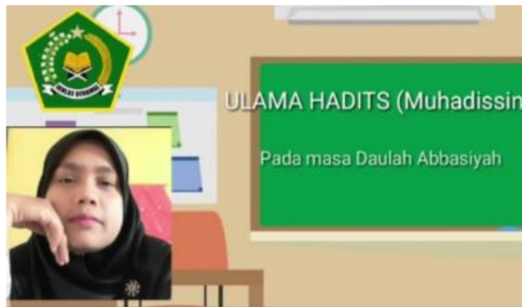
Figure 3. Videos using the Kinemaster App

The Kinemaster App. The Kinemaster application in making learning videos is quite easy to use. To produce good videos, we must know the features of the video editing application. Because the editing process will be difficult to run optimally if you don't know the features in the application. The step that must be prepared is to prepare the materials or teaching materials that will be delivered. Then create videos, images, text, and music. Using kinemaster media produces uniformity in observing the material, instilling the right concepts, and raising the enthusiasm of students to study well, the media can create desire and learning that is carried out using audiovisual media can change students' learning attitudes so that learning outcomes increase.