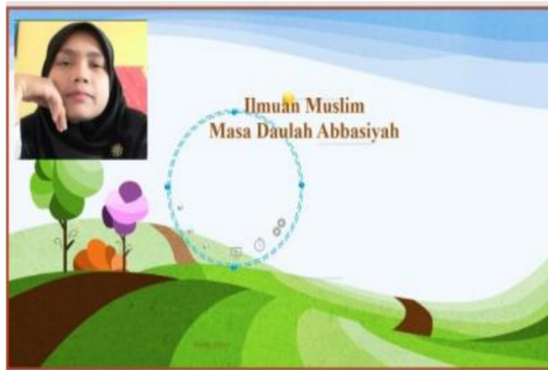
Figure 2. Animated video with PowerPoint

The Kinemaster App. The Kinemaster application in making learning videos is quite easy to use. To produce good videos, we must know the features of the video editing application. Because the editing process will be difficult to run optimally if you don't know the features in the application. The step that must be prepared is to prepare the materials or teaching materials that will be delivered. Then create videos, images, text, and music. Using kinemaster media produces uniformity in observing the material, instilling the right concepts, and raising the enthusiasm of students to study well, the media can create desire and learning that is carried out using audiovisual media can change students' learning attitudes so that learning outcomes increase.