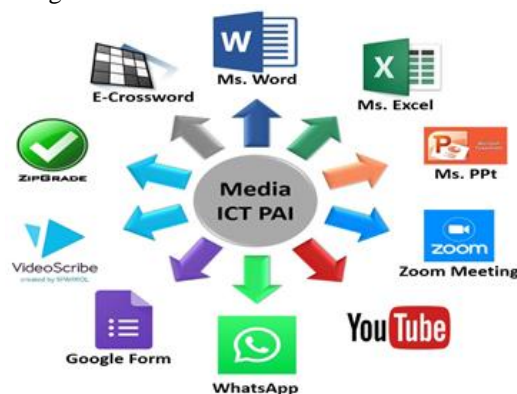
Fig 2. Designed and Used ICT Media by Teachers in Islamic Education Learning

Based on the data found, Islamic religious education teachers who become the members of the West Pasaman branch of AGPAII have the ability to design various types of learning media. In accordance with conveyed by the informant, the AGPAII management has a strong commitment to realizing that all members have the ability in terms of ICT (Informant 1, Interview, 2020), therefore all Islamic Education teachers are periodically given the opportunity to take part in training on the use of ICT in learning (AGPAII Management, Interview, 2020). From various trainings followed, the teacher ability to design instructional media is incorporated in Figure 2 below: